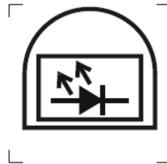
FIG. 1 SYMBOL FOR BUILT-IN MODULES

independent modules. The mark shall be located on the packaging or on the module itself.